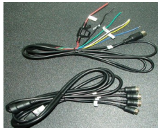
Power supply adapter cable